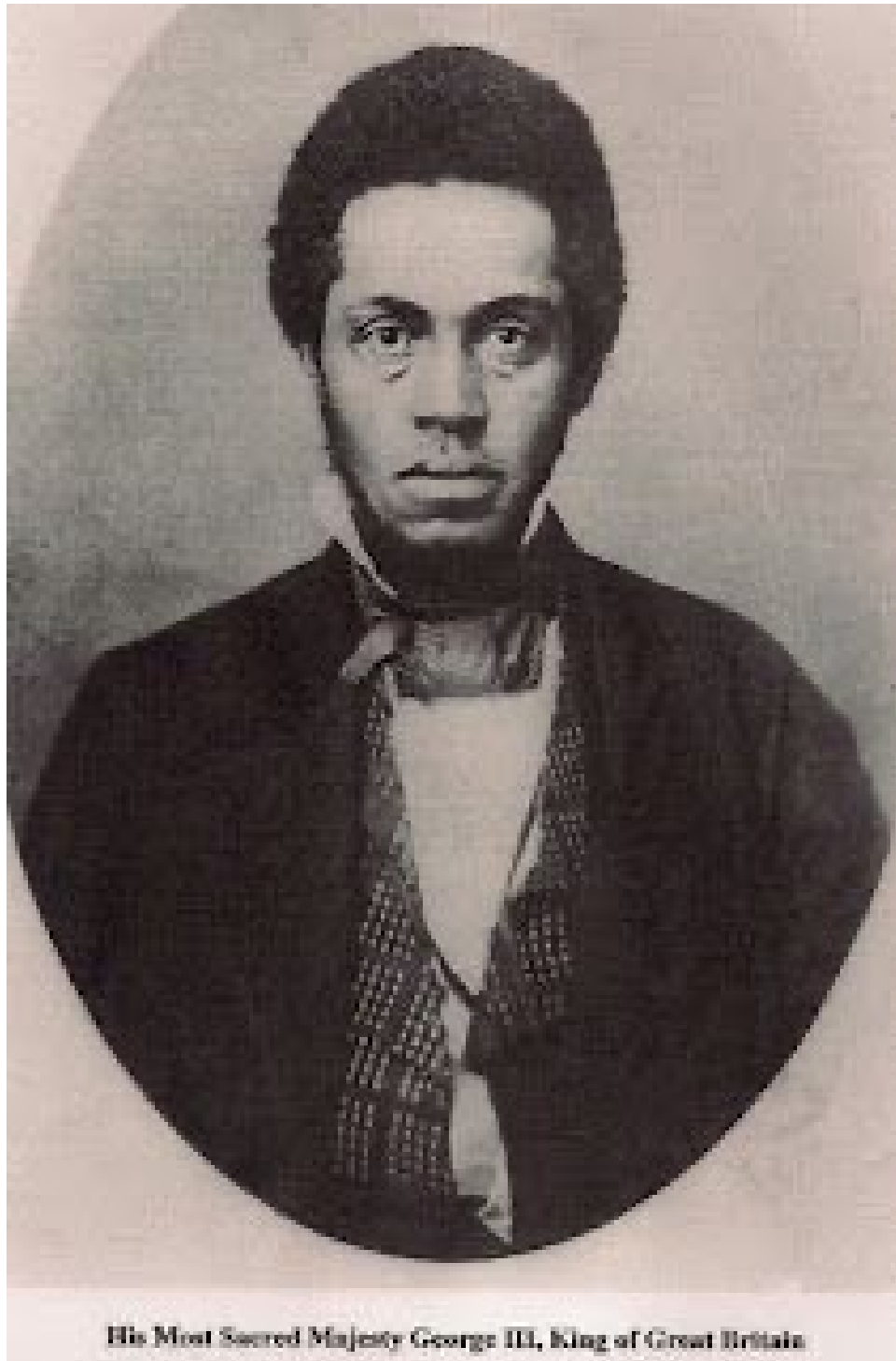
His Most Sacred Majesty George III, King of Great Britain

Although the Declaration of Independence of 1776 freed the slaves, slavery was still oppressive throughout the thirteen colonial territories. It was repackaged and sold in a new form known as debtor camps of debtor prisons. Before diving into the debtor camps, Abraham Lincoln stated it was the Articles of Confederation of 1778